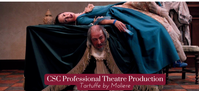
CSC Professional Theatre Production Tartuffe by Moliere

400 Jefferson Street Hackettstown, NJ 07840 Phone: (908) 979-0900 Fax: (908) 979-4297 CentenaryStageCo.org